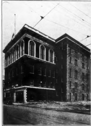
PYTHIAN TEMPLE, DALLAS TEX.